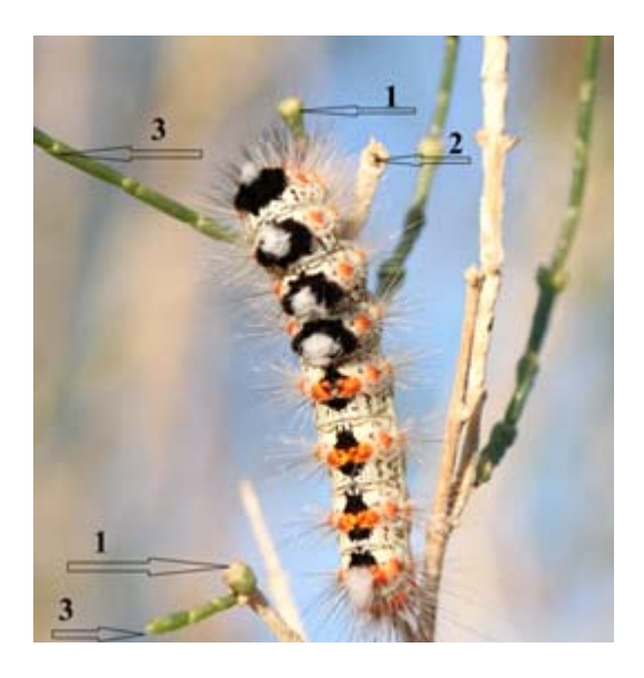
Fig. 1. Caterpillar of Orgyia dubia Tausch . Is damaging the assimilating shoots: 1 – damaged shoots, 2 – damaged shoots of last year, 3- undamaged shoots