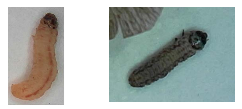
Fig. 4. The caterpillars of Case-bearer (A) and Hysterosia subfumida (B) are damaging seeds of Saxaul

with biological features development of Saxaul and are divided into two seasons: spring species, that are damaging flowers and autumn species – damaging seeds or fruits of Saxaul.