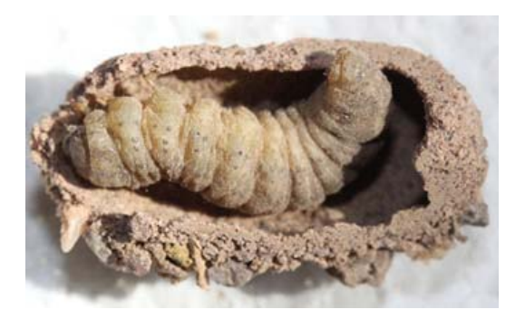
Fig. 2. Caterpillar of Pseudohadena immunda in a ground cocoon before pupation