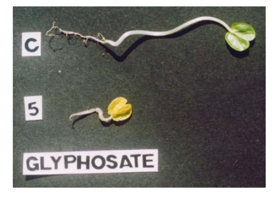
Fig. 3: Control seedling. 5 - Seedling at 600 ppm of glyphosate.