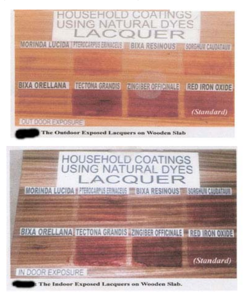
Fig. 3: Applications of lacquers on wooden slabs