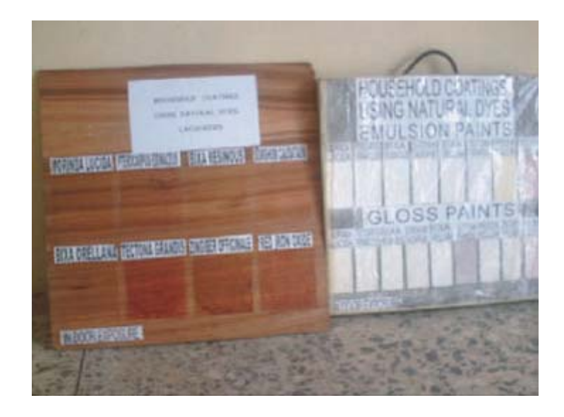
Fig. 2: Application of the surface contings on wooden and concrete slabs