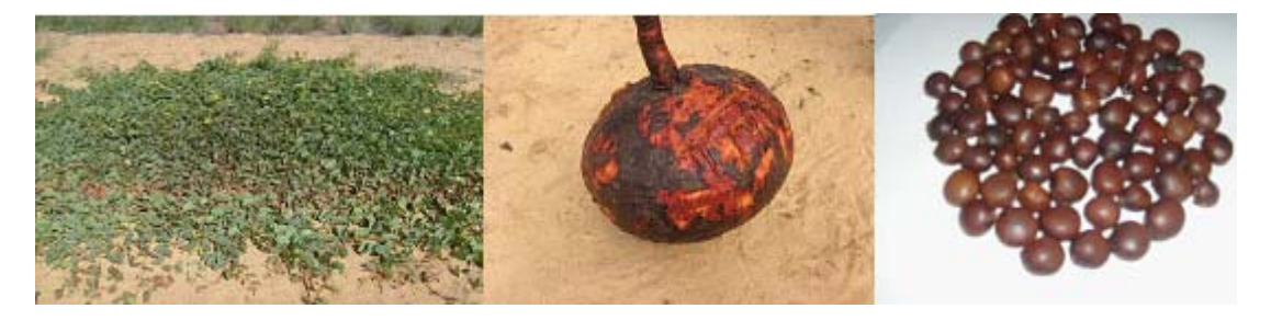
Fig. 2. A wild patch of Tylosema esculentum (marama bean) with bright yellow flowers (left panel); a root tuber of marama bean (middle panel) and mature brown-coffee marama bean seeds (left panel)

a perennial species, producing a prostrate vine with numerous prostrate stems of up to three meters in length which spread from an enormous woody tuber below the ground (Figure 2) (Powell, 1987). Tubers (Figure 2) have a reddish-brown bark and usually taper to a thinner neck-like structure near the soil surface, from where the annual branches grow during the rainy season. Forked tendrils are found along the stems. The characteristic leaves are deeply two-lobed, hairless, and firm in texture. Attractive bright yellow flowers are born along the stems, each with erect petals and stamens, and are followed by large brown seeds of about 20 millimetres in diameter with a mass of about three grams each. The seed coat is about two millimetres thick, and encloses the delicious and nutritious white nut (Van Wyk & Gericke, 2000). Marama seeds (Figure 2) compete with peanut and soybean in nutritive quality while the young tubers contain protein and are more nutritious than potato or yam. The plant thrives in poor-quality soil and under the harshest of climates (National Research Council, 2006).