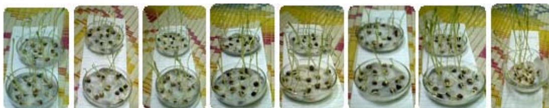
Plate 1. The photographs showing variation in seedling height and number of germinated seeds treated with 5kr, 5kr+NMU, 10kr, 10kr+NMU, 15kr, 15kr+NMU, NMU and Control respectively (from left to right)