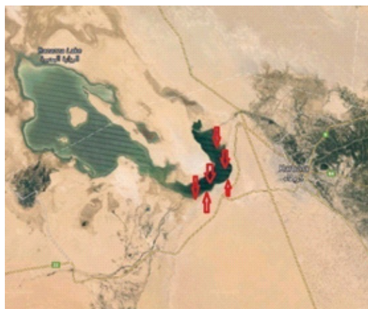
Fig. 1. Map of sampling sites at the south and southeast of Lake Razazah, Karbala, Iraq. The map was derived from Satellite World Map in 2014 [31]. Red arrows show the sampling sites

less than one third of isolates were able to produce alkaline amylase and alkaline lipase. Near to half of them showed the ability of protease and alkaline protease production (Figure 2). In contrast with the study of Rohban et al. , no lipase and amylase activity was reported for Oceanobacillus isolates 41 . Kumar, S. et al. introduced Bacillus isolates as halophilic microorganisms with the maximum ability of lipase and protease production from soil and water samples in India 42 . Similar to our results, they found Oceanobacillus strains showed extracellular protease activity. Halomonas isolates from the Tunisian Solar Saltern also showed