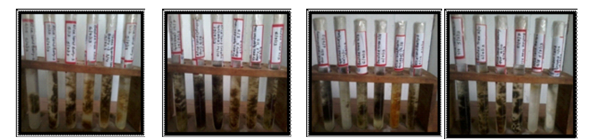
Fig. Preservation of Purified Organism

Purifications were done by tube dilution methods. Preservation was done in Liquid paraffin