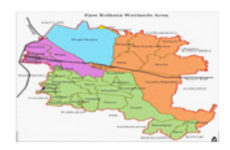
Fig. Map of East Kolkata Wetlands

241.30 hectares of wetland area have been added to the system to integrate it.