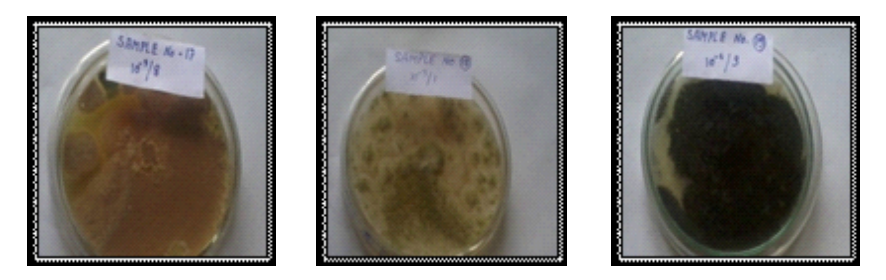
Fig. Isolated organism from soil of Dhapa

that live with in them. Specifically, Wetlands are characterized as having a water table that stands at or near the land surface for a long enough period each year to support aquatic plants. Wetlands have also been described as ecotones. The largest Wetlands in the world include the swamp forest of the Amazon and the Peatlands of Siberia. Wetlands play an important role in their ecology. Such wetlands are important breeding grounds for waterfowl and wildlife in general.