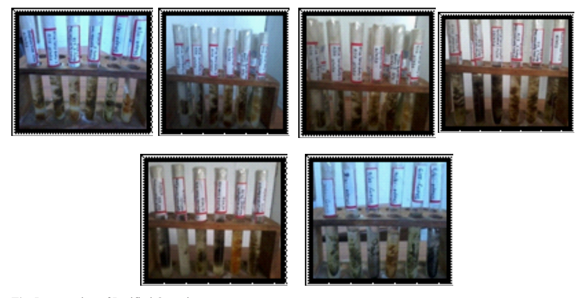
Fig. Preservation of Purified Organism