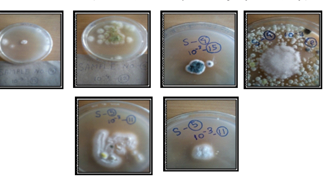
Fig. Isolated organism from Soil, Collection Date:- 07/07/2016

Fig. Date of Collection 17.07.2016 (Naktala Road, Bantala tannery, Bantala sewage desposal cannel, Dhapa)