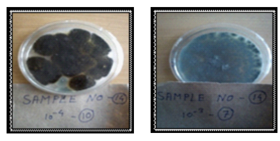
Fig. Isolated organism from soil, Collection Date :- 17/07/2016

that live with in them. Specifically, Wetlands are characterized as having a water table that stands at or near the land surface for a long enough period each year to support aquatic plants. Wetlands have also been described as ecotones. The largest Wetlands in the world include the swamp forest of the Amazon and the Peatlands of Siberia. Wetlands play an important role in their ecology. Such wetlands are important breeding grounds for waterfowl and wildlife in general.