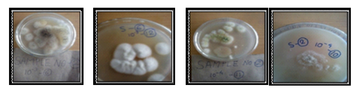
Fig. Isolated organism from Soil, Collection Date :- 08/07/2016

A patch of land that develops pools of water after a rain storm would not be considered a "wetland" even though the land id wet. Wetlands have unique characteristics: they are generally distinguished from other water bodies or landforms based on their water level and on the types of lands