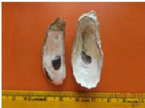
Fig. 1. Crassostrea madrasensis

While analyzing the molecular weight of the crude protein extract of Crassostrea madrasensis using SDS-PAGE analysis with the