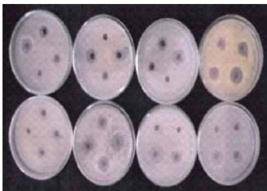
Fig. 2. Antibacterial activity of Crassostrea madrasensis extract against human pathogens