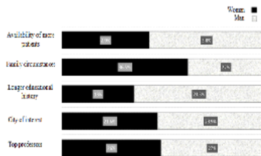
Fig. 2. Chart showing percent frequency of participants of specialized dental assistant examination shown separately in terms of the first motivation behind choice of place of study in the event of admittance to the specialized field of studies