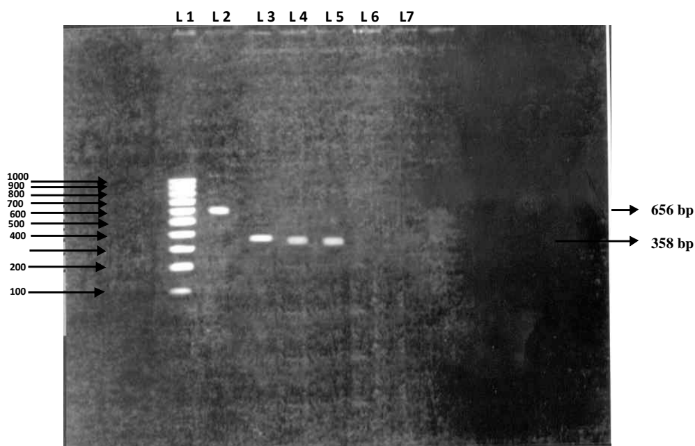
Fig. 1: RT-PCR for induction of cytokines IL-4

Among four different extracts tested for inhibition on mitogen induced lymphocyte proliferation at three different concentrations, I. tinctoria showed maximum inhibition of lymphocyte proliferation of 70% followed by A. tetraacantha 48%, S. nigrum 47% and least in E. hirta 37%. At 100µg/ml, it was maximum inhibition of lymphocyte proliferation when compared to 50 and 150 µg/ml (Table 2).