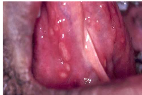
Fig. 7: Aphthous ulceration