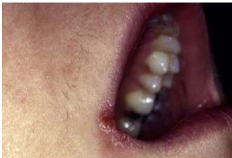
Fig. 6: Angular cheilitis