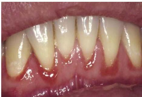
Fig. 1: Linear erythematous gingivitis

The most common HIV-related oral lesion is candidiasis, predominantly due to Candida albicans . While Candida can be isolated from 30–50% of the oral cavities of healthy adults, making it a constituent of the normal oral flora, clinical oral candidiasis rarely occurs in healthy patients. In stark contrast, clinical oral candidiasis has been reported to occur in 17–43% of patients with HIV infection and in more than 90% of patients with AIDS. One