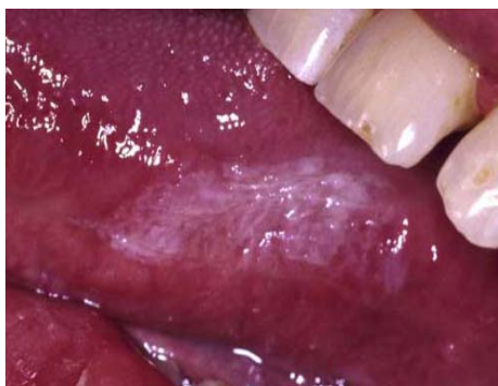
Fig. 3: Oral hairy leukoplakia