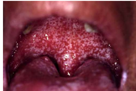
Fig. 5(a): Pseudomembranous candidiasis