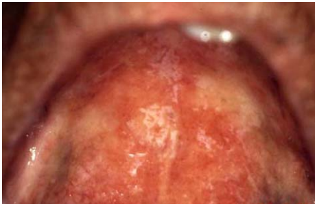
Fig. 5: Pseudomembranous candidiasis

Major aphthous ulceration is the most common immune-mediated HIV-related oral disorder, with a prevalence of approximately 2–3%. The large solitary or multiple, chronic, deep, painful ulcerations of major aphthae appear identical to those in non-infected patients, but they often last much longer and are less responsive to therapy (Fig. 7, 8).