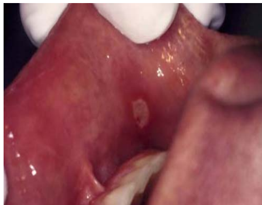
Fig. 8: Aphthous ulceration