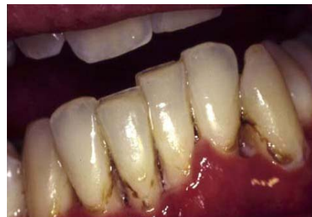
Fig. 2: Necrotizing ulcerative periodontitis