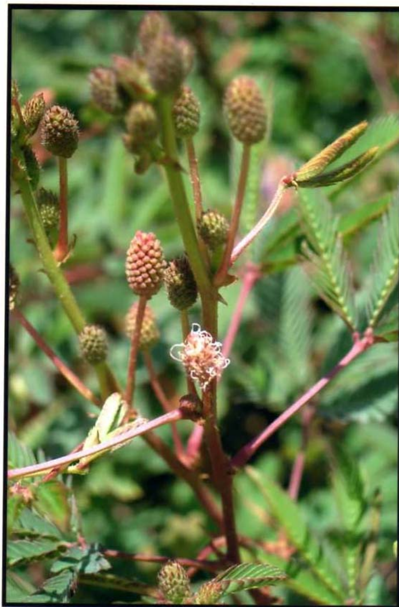
Fig. 1: Photograph of Sphaeranthus indicus