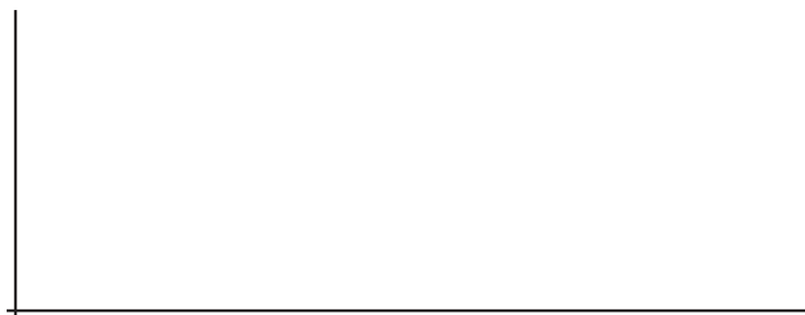
Fig. 2: Influence of inoculum size on phenol degradation