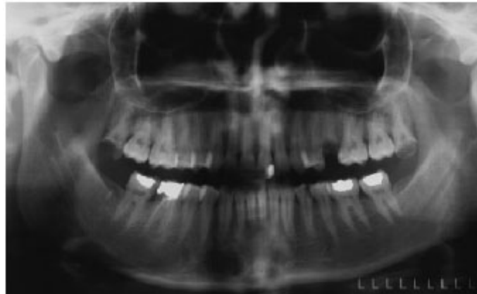
Fig. 1: Panoramic radiograph shows a large maxillary sinus