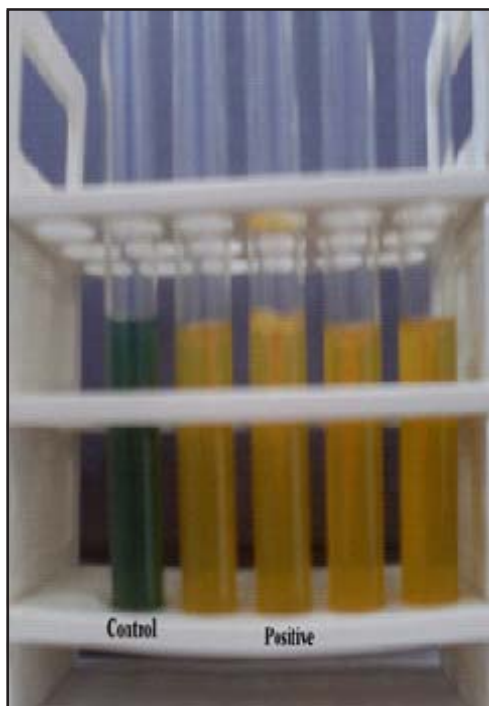
Fig. 1: Hugh and Leifson's test