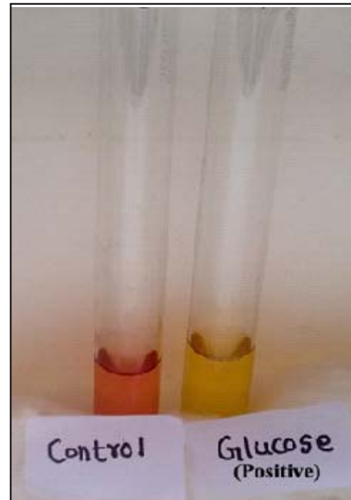
Fig. 2: Sugar Fermentation test

Endospore test showed that the bacteria were non-spore forming, showing negative result (red colour) instead of forming positive result (green colour). Hugh and Leifson's test showed that all the bacterial cultures were capable of producing fermentation. Fermentative organisms developed acidic conditions in anaerobic conditions, while oxidative organisms produced acid in aerobic conditions (Fig. 1).