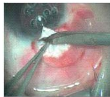
Fig. 9: Peripheral iridectomy