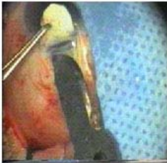
Fig. 4: Unroofing of Schlemm canal