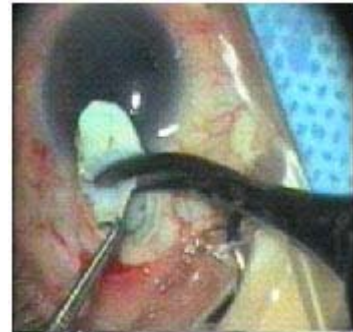
Fig. 6: Excision of deep scleral flap