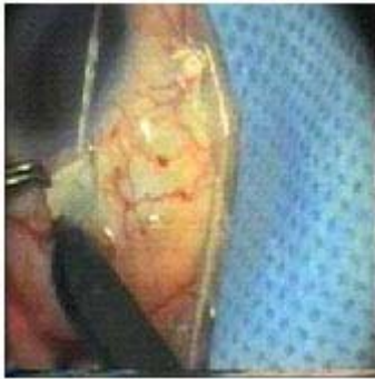
Fig. 1: Dissection of superficial scleral flap