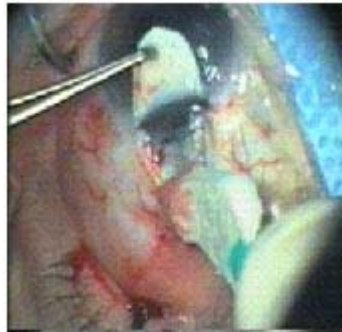
Fig. 5: Trabeculo-Desceement's membrane