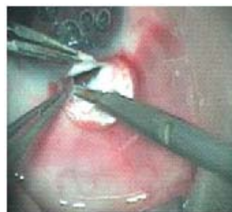
Fig. 8: The trabecular block was removed