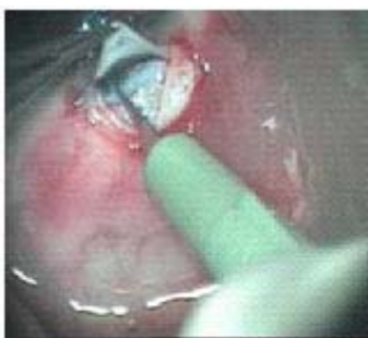
Fig. 7: Vertical incision on the side of the trabeculum