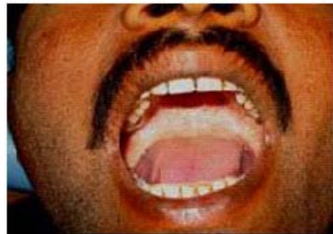
Fig. 4: Healed ulcer on soft palate