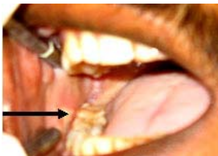
Fig. 3: Erosion on right buccal mucous