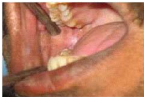
Fig. 5: Healed erosion