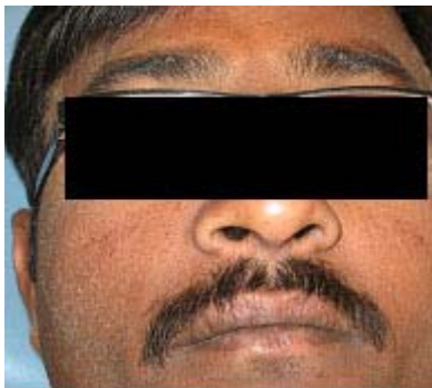
Fig. 1: Patient profile

Based on history and clinical features a provisional diagnosis of tubercular ulcer on soft palate and oral submucous fibrosis was given.