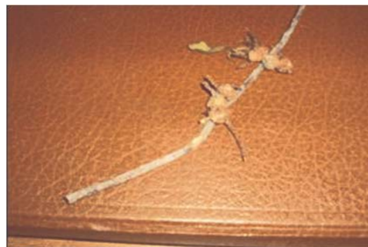
Fig. 1. Galls on Ficus cordata twigs

The objective of this study was to isolate and identify the causal agent associated with gall formation on Ficus cordata in the Otavi Mountains using ITS-PCR technique. A single pure cure was consistently obtained in all the isolate of the Ficus cordata fungal cultures. Sequencing and analysis of the DNA samples revealed the identity of the fungus as a crop pathogenic fungi belonging to the Dothideomycetes species. Pair-wise sequence alignment of the obtained sequence with the sequences already existing in the Genbank through nucleotide BLAST searches revealed that the