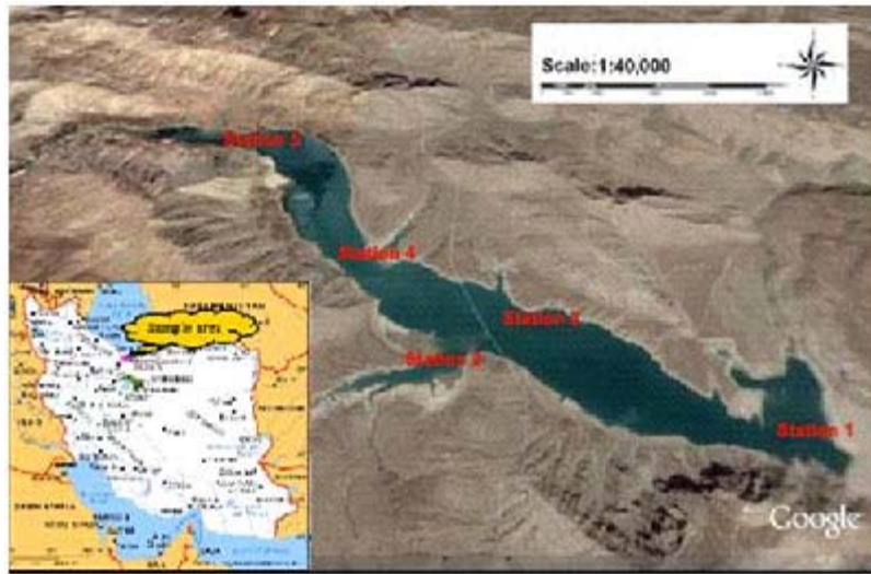
Fig. 1. The location of the sampling station of zooplankton in the Lar reservoir