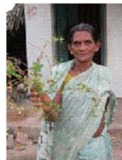
Fig. 5. Apanakondadoramma at Timmapuram, demonstrating the plant Spermaceoehipida