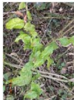
Fig. 4. Plumbago zeylinica , demonstrated by old men of Jaddangi