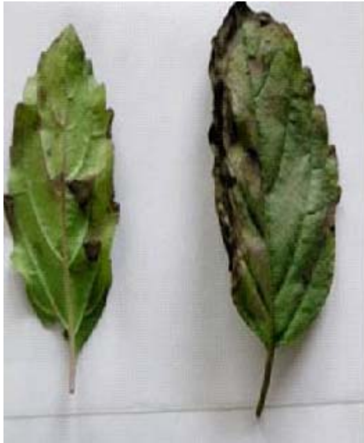
Fig. 1. Infected leaf of basil showing spots

hypophyllous, effuse, brown. Mycelium internal and external, external hyphae septate, thin walled, smooth, branched, light brown. Stromata absent.