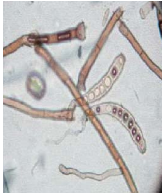
Fig. 2. Germinating conidia