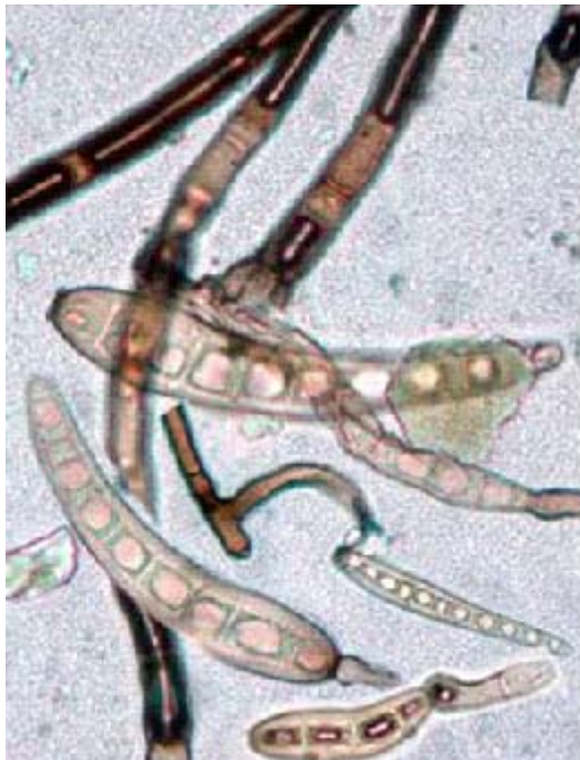
Fig. 3. Conidia and Conidiophores