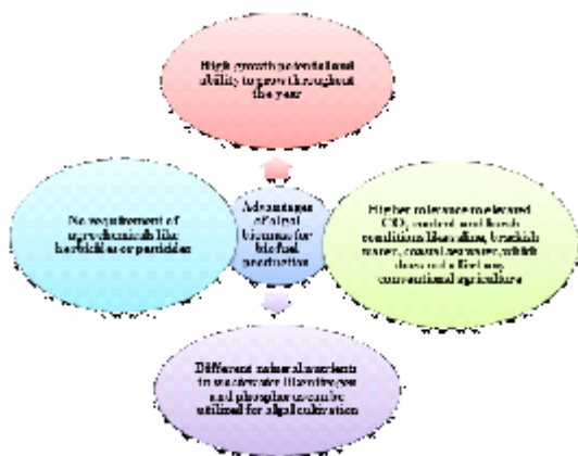
Fig. 2. Advantages of algae biomass for biofuel production

A photo-bioreactor is closed vessel which provides a controlled environment and enables high productivity of algal biomass. Here, all the growth requirements of algae are fed into the system and the system is controlled as per the requirement. This system enable better control of culture conditions such as light exposure, water and CO 2