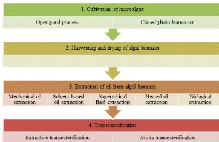
Fig. 3. Process of biodiesel production from algal