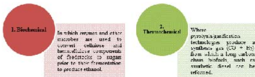
Fig. 1. Processes for conversion of lignocellulosic biomass into biofuel

Open pond system includes algal cultivation in natural waters such as lakes, lagoons, natural as well as artificial ponds and containers. Cultivation of algae in open ponds has been widely studied 37,38 . The main advantage of open ponds is that they are much easier to construct and operate than closed systems 39 . However, there are many disadvantages such as poor light utilization by