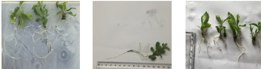
Fig. 3. Root initiation of Gardenia jasminoides micro shoots on half strength MS medium containing 4.0 mg/L activated charcoal and supplemented with different concentrations of : a) IBA ; from left to right : 1.5 , 1.0, and 0.5 mg/L. b) longest root length ( 11 cm at 1.0 mg/L IBA ). c) NAA ; from left to right : 2.0, 1.5, 1.0 and 0.5 mg/L after 6 weeks of culture