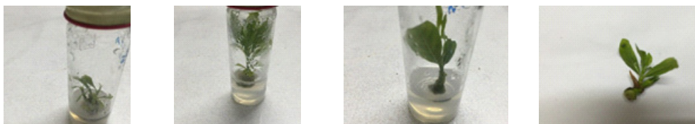
Fig. 2. Multiplication and elongation of Gardenia jasminoides shoots on MS medium supplemented with TDZ+IAA at different concentrations with 3.0 mg/L \text{GA}_3 after 8 weeks of culture: a) shoot multiplication, b) and c) different lengths of elongated shoots, d) in vitro formation of flower bud ( arrow )

3.0 mg/L TDZ + 0.1 mg/L IAA gave highest fresh weight ( 488 mg ) and 2.0 mg/L TDZ + 0.3 mg/L IAA was the best for shoot dry weight ( 86.7 mg ). Generally , the effect of plant growth regulators