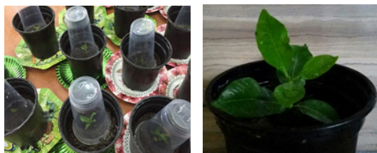
Fig. 4 . a) acclimatization of Gardenia jasminoides microplants in pots . b) hardened plant after 3 months of acclimatization ready to transfer to green house.

specially cytokinins in their role in activate the chlorophyllase enzyme which active chlorophyll synthesis and their role in activate the absorption of water by growing shoots and translocation of nutrients in shoot , also , the presence of sucrose in the medium resulted in the carbohydrates accumulation in growing shoots which encouraged by growth regulators lead to the increasing of fresh and dry weights of shoots 21,22 .