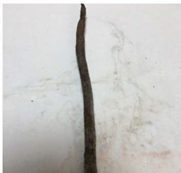
Normal Short Root

A study from different part of world of pollen were recorded from the Antilles in mexico, the, the northern South America and Central America 8 indicates the neotropical environments were firstly occupied by Nypa , Pelliceria , Acrostichum , and Brevitricolpites variabilis . About 50 million years. In Miocene Avicennia appeared late in this part (10 million years ago). In the Middle Pliocene six mangrove species