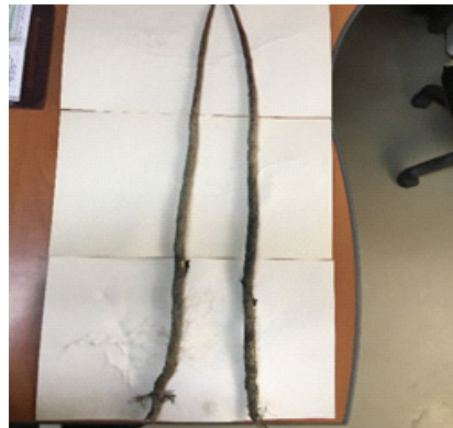
Long Adapted Roots