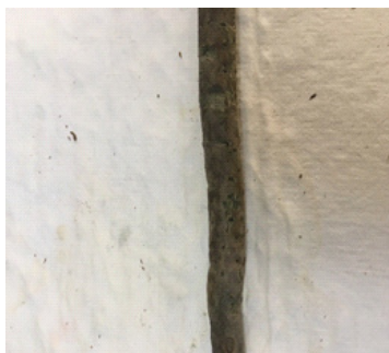
More spores for oxygen absorption

There were a significant amount of and internal and external specific differences among variants of mangroves . These Differences can be morphological differences had been noticed between western atlantic species and west african species of Avicennia germinans 16 and A. germinans and Rhizophora have been identified as distinct chemo