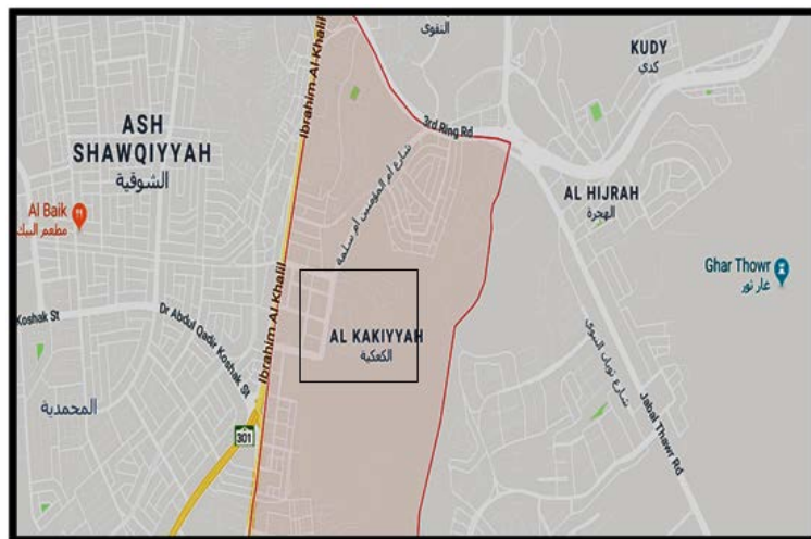
Fig. 1. Site of cysticercus ovis in goats collected from Al Kakee's Slaughter, Makkah, Saudi Arabia (by Google map)