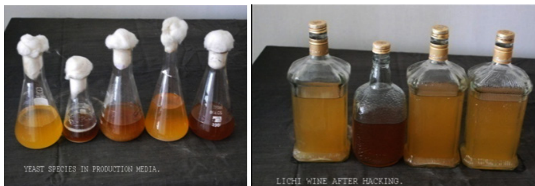
Fig. Wine produced from Litchi ( Litchi chinensis ) by local isolated strain of yeast

+++ High response, ++Moderate response, +Low response, - - - No response