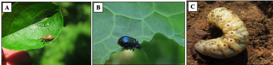
Fig. 3. Other apple pests attacking the apple orchards

In view of the above, Government of India adopted an Integrated Pest Management (IPM) plan for overall crop protection and also launched