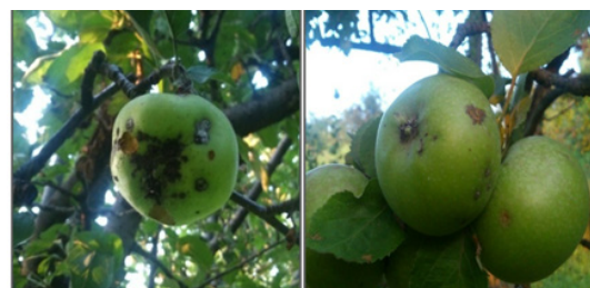
Fig. 6. Damage due to apple Scab

a program regarding this in 1985. The ministry of Agriculture and Farmers Welfare Department of Agriculture, Cooperation & Farmers Welfare Directorate of Plant Protection, Quarantine and Storage collectively oversee the implementation of IPM. Its commencement dates back to 1992 when 26 Central Integrated Pest Management Centres (CIPMCs) were established by merging all Central Plant Protection Stations (CPPS), Central Surveillance Stations (CSS) and Central Biological Control Stations (CBCS). Later, 5 more CIPMCs were established in the 10th Five Year Plan and further 4 centers were established in the 12th Five Year Plan period. As of date, 35