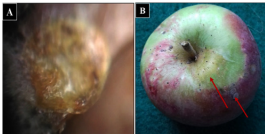
Fig. 1. Photomicrograph of San jose scale (40x) (A); and the damage on the fruit(B)

Despite playing an un-doubtful role in crop protection and increasing the crop yields, the risk factors associated with the pesticides cannot