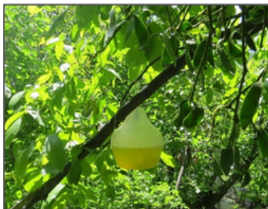
Fig. 4. Pheromone trap as a quantitative sampling device