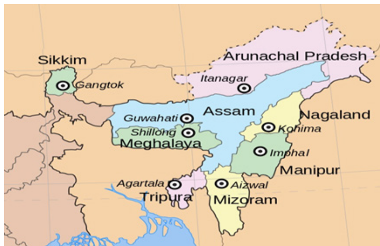
Fig. 1. Image of political boundaries of seven northeast states

Plants having the properties of antimalarial components such as alkaloids, sesquiterpenes,