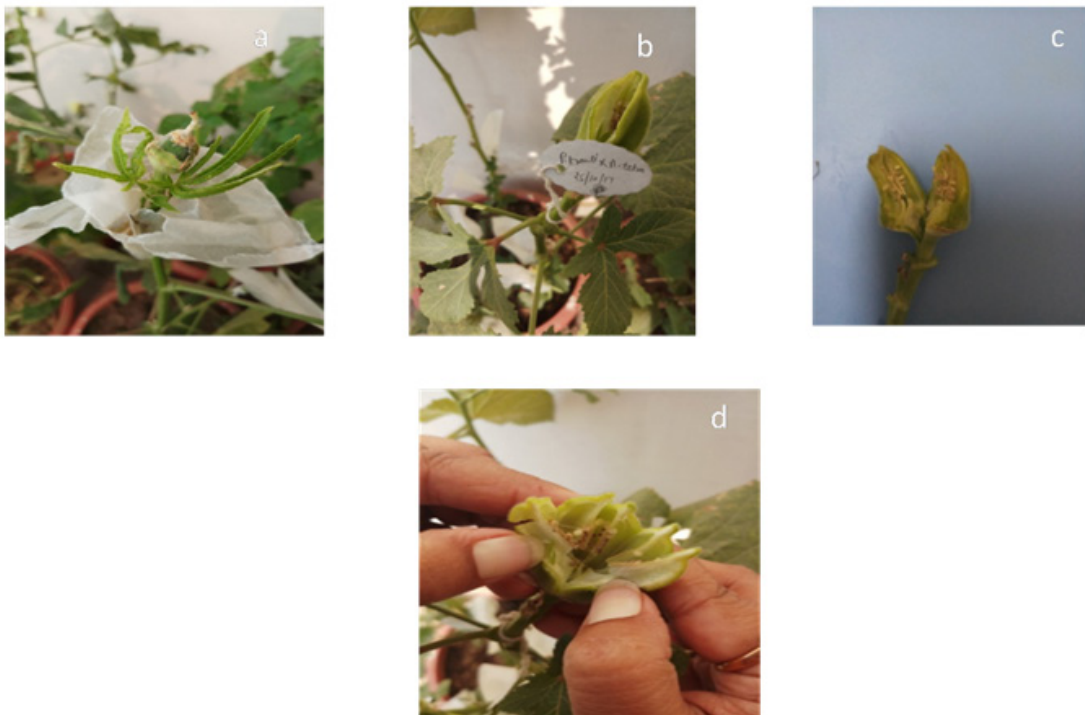
Fig. 2. (a to d) Small interspecific hybrid fruit b) Distal cracking in the fruits 25 DAP c) Small while yet succulent seeds after 15 DAP d) Degeneration of seeds 25 DAP