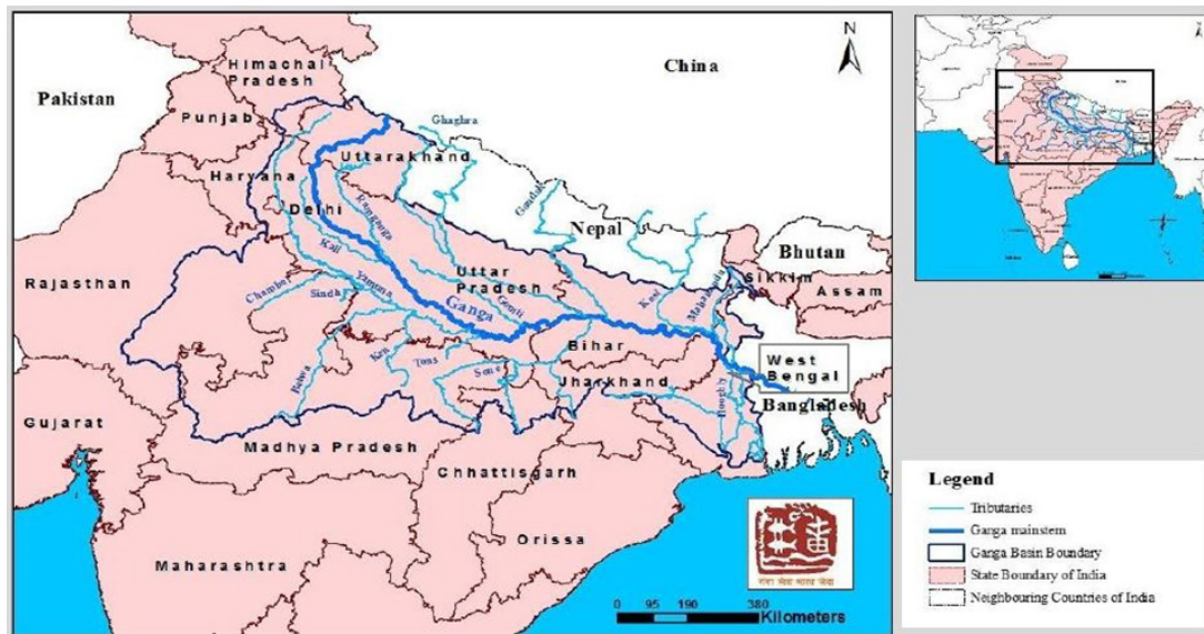
Fig. 2. Map showing Yamuna river 27