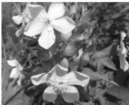
Fig. 1. Saponaria officinalis