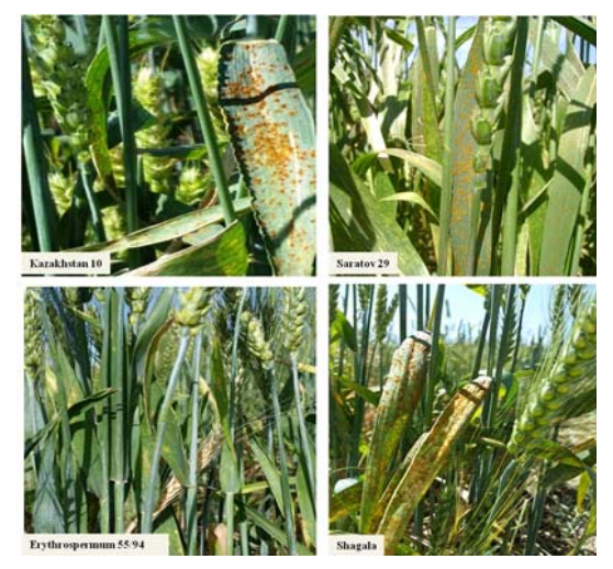
Fig. 2. Stable and susceptible grades of spring-wheat to leaf rust

According to laboratory and field researches types of resistance of soft spring-wheat grades are defined. The grades with juvenile and age resistance are of interest as sources of resistance and are a valuable material for selection in immunity to a leaf rust.