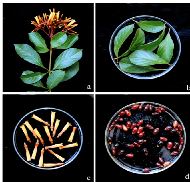
a) Hamelia patens twig with flowers

extract value varied from 4.25, 4.50, 5.0 and 5.50 mg/ml respectively. Further investigation was performed to demonstrate the action of the extract on these fungi at different concentrations. The growth of these fungi correspondingly decreased with increasing concentration of the extract and the growth was completely inhibited at these MIC values. The MIC determination is important in giving a guideline of the choice of an appropriate and effective concentration of anti-fungal therapeutic substance.