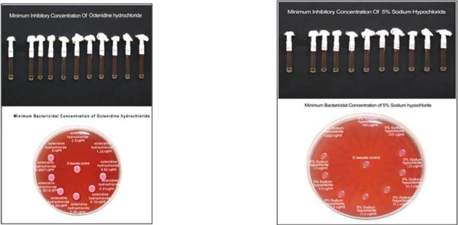
MIC and MBC of Octenidine and Sodium hypochlorite