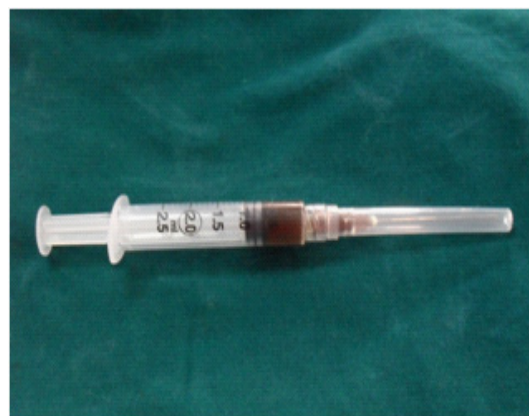
Fig. 5. FNA revealing chocolate brown, hemorrhagic aspirate