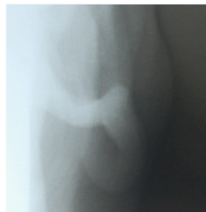
Fig. 2-3. Rotated PA view and soft tissue cheek revealed a radiopaque oval mass below the zygomatic arch connected to a radiopaque stalk