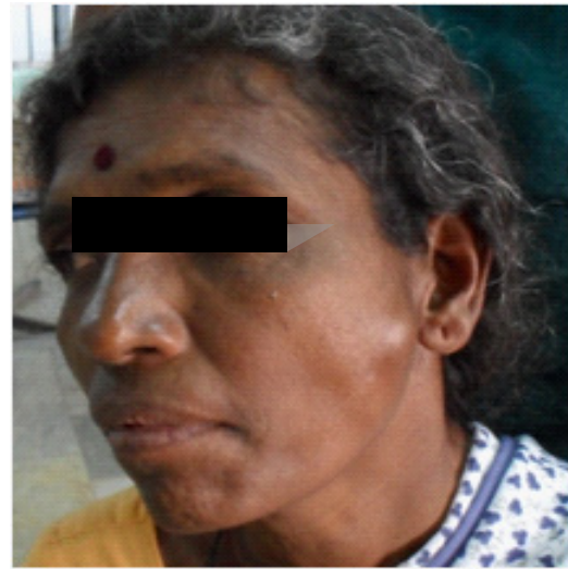
Fig. 1. Swelling over left parotid region

asymptomatic. But she reported it to be enlarging in size. The skin over the lesion appeared to be stretched. On palpation, the consistency of the mass was elastic firm and was non tender in nature. The swelling becomes more prominent on clenching the teeth. Intraoral examination of the left stenson's duct opening on the buccal mucosa appeared to be normal. A provisional diagnosis of benign tumor of parotid gland was arrived. The patient was subjected to various investigations such as conventional radiography, ultrasonography and fine needle aspiration biopsy (FNA). Radiographs such as rotated postero-anterior (PA) view and soft tissue radiograph of the left cheek were taken. Both the rotated postero-anterior (PA) view revealed a radiopaque oval mass below the zygomatic arch connected to a radiopaque stalk (fig2&3). Ultrasonography