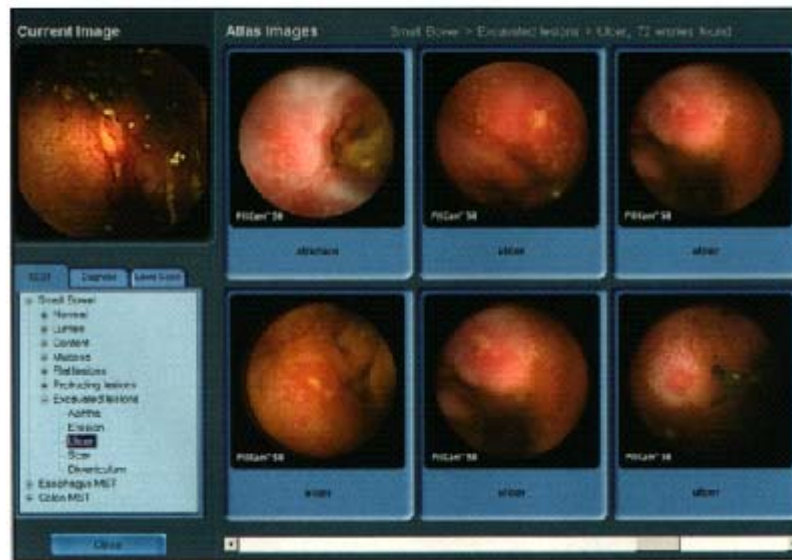
Fig. 3. Given Imaging endoscopic atlas

or with the help of diagnosis. The picture of a known pathology and the image, chosen by the endoscopist, are simultaneously demonstrated on the screen. The atlas gives an opportunity to widen knowledge for advanced users, but it is not a replacement of endoscopy 8 .