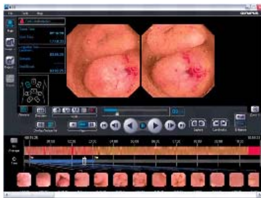
Fig. 1. Olympus software interface (bleeding recognition)

Olympus software is considered convenient in use for manual analysis and has only one intellectual function – search of bleeding (Fig. 1). 14