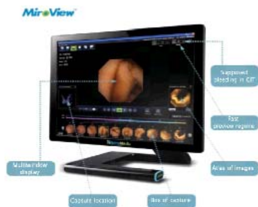
Fig. 4. Interface of IntroMedic software

In the Table 1 we can see some functional specification of Olympus, Given Imaging and Intro Medic.