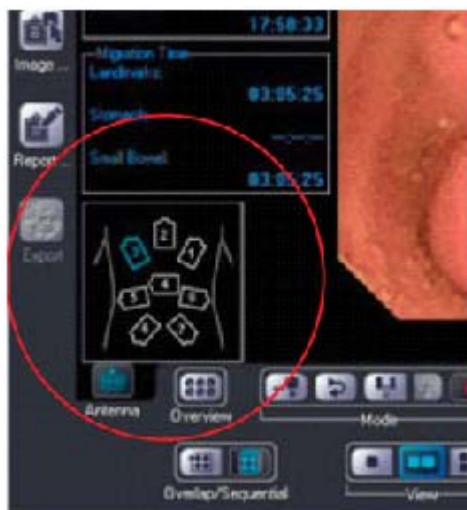
Fig. 2. Data about the capsule location received from external sensors of the Olympus capsular endoscopic complex

Due to technical solutions of the Olympus capsular endoscopic complex, the GIT area, where the capsule is presumably located, is simultaneously determined during the review of images. This option is attained because not only images are saved, but data about the strongest signal received from endoscopic capsule, which the antenna of reading sensors captured (in Fig. 2 this sensor is marked in blue colour).