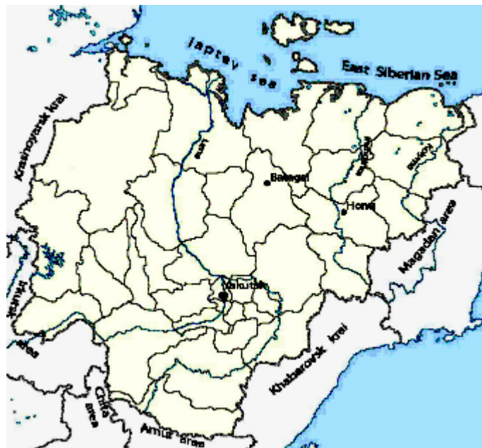
Fig. 1. Republic of Sakha (Yakutia), Russian Federation